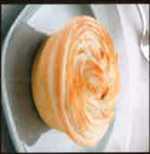
Shepherd's Pie Marking: Potato Allergens: contains Gluten, Milk and Soy. May contain Egg and Sesame.