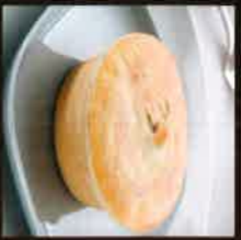
Aussie Beef Pie Marking: Plain Puff Pastry Top Allergens: contains Gluten, Milk and Soy. May contain Egg and Sesame.