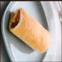
Sausage Roll Marking: Puff Pastry Roll Allergens: contains Gluten, Milk, Soy and Sulphites. May contain Egg and Sesame.