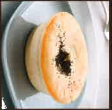
Beef & Mushroom Pie Marking: Poppy Seed Allergens – contains Gluten, Milk and Soy. May contain Egg and Sesame.