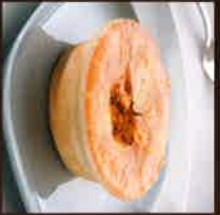
Beef & Curry Pie Marking: Curry Powder Allergens – contains Gluten, Milk and Soy. May contain Egg and Sesame.