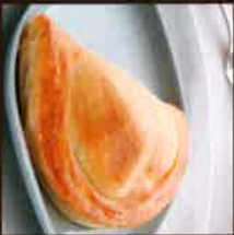
Vegetable Pastie Marking: D-shape fold Allergens: contains Gluten, Milk and Soy. May contain Egg and Sesame.