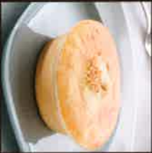
Chicken & Vegetable Pie Marking: Sesame Seed Allergens: contains Gluten, Milk, Soy and Sesame. May contain Egg.