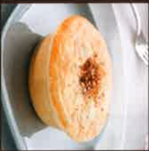
Beef & Red Wine Pie Marking: Paprika & Sesame Allergens: contains Gluten, Milk, Soy and Sesame. May contain Egg.