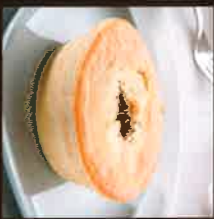
Thai Chicken Pie Marking: Paprika, Parsley, Poppy, & Sesame Allergens: contains Gluten, Milk, Soy, Sesame & Cuscuta. My contain Egg.