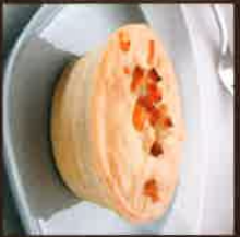
Beef, Bacon & Cheese Pie Marking: Cheese Allergens: contains Gluten, Milk and Soy. May contain Egg and Sesame.