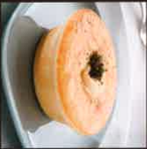
Chunky Angus Beef Pie Marking: Parsley Allergens: contains Gluten, Milk and Soy. May contain Egg and Sesame.